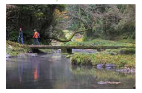
(Kagoshima Prefecture) Kirishima Myoken Course, Inukai-no-Taki Waterfall Upper Stream Path (Low-water bridge)