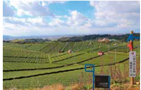
(Fukuoka Prefecture) Yame Course, Yame Chuo Daichaen (Great Tea Plantation)