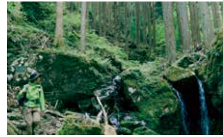
Minamisanriku Town: Mt. Tatsuganesan A road to enjoy nature and climate, and feel the livelihood