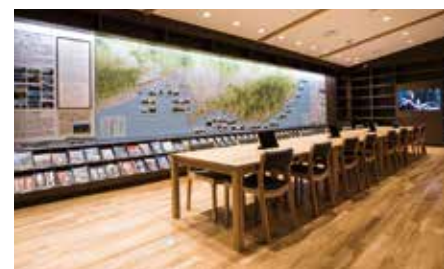
Natori City: Natori Trail Center, one of the facilities offering information

Overlapping with nature's blessings, harsh yet rich environment, people's lives in harmony with nature, their accumulated history and culture are connected to this day. The warm interaction between the walkers is also one of its main attractions. Come for a walking journey in Tohoku.