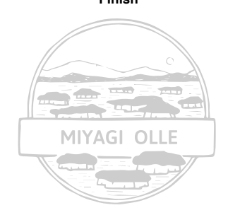
Otakamori View of Matsushima from above Scenic view